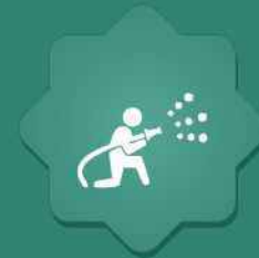
FIRE FIGHTING SYSTEM