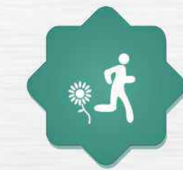
JOGGING TRACK AT SKIP FLOOR LEVEL